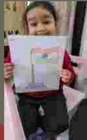
Expressing their Patriotic Fervour