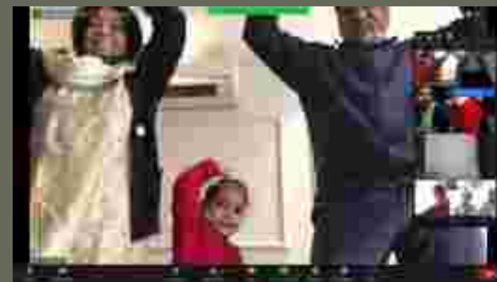
Love for Grandparents